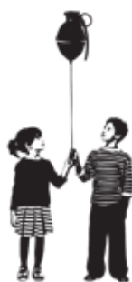
WAR CHILDHOOD MUSEUM

Rising from the crowd-sourced book War Childhood and championing the principles and practices of social entrepreneurship, the independent, youth-led War Childhood Museum has garnered recognition as the world's only museum focused exclusively on childhoods affected by war.