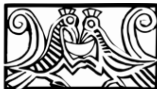
МУЗЕЈ ХЕРЦЕГОВИНЕ ТРЕБИЊЕ

The museum was established in 1952 and re-named The Museum of Herzegovina in 1994. After many relocations the institution found its home in 1989 in the building of a former gymnasium and once Austro-Hungarian barracks placed in the Old Town. The museum building occupies 1,500 sq.m. (the exhibition halls with all accompanying annexes take up 800 sq.m). There are eight permanent displays: the archeological exhibition, the Dučić collection, ethnographic display, the memorial exhibition of paintings of Atanasije Popović, the old town house from the late 19th and early 20th century as well as bequest galleries of Milena Šotra and Radovan Ždrale. The museum also holds three other bequests. The permanent natural history exhibition is at the realization stage. Museum has a gallery for periodic exhibitions, promotions of books and literary evenings as well as for chamber music concerts. There is also a library with books from different fields of science and art.